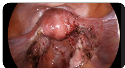
Image: Endometriosis on pelvic organs